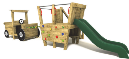
Tractor, Lords Hill