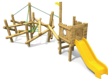
Freeplay climber, Lords Hill