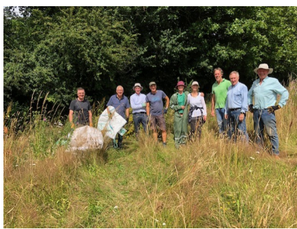
Environment Group Activities in Shamley Green and Wonersh