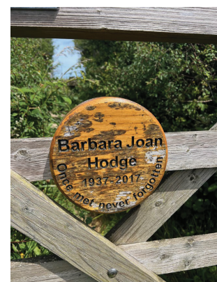
Plaque on gate

All the community are very welcome to join in WEAG volunteer activities and have the opportunity to sponsor one of the planned new gates in the Barnett Fields or a new tree by contacting anthony.shutes@wonershparish.org or clerk@wonershparish.org . The sponsor can opt to have their name or that of a relative on a plaque - Example plaque in the photo to the right.