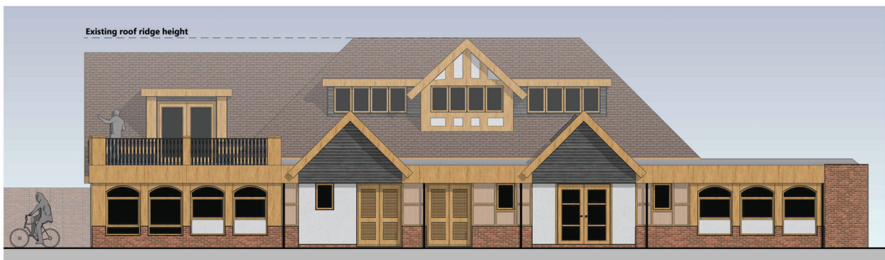
Arbuthnot Hall: Proposed West (Side) Elevation