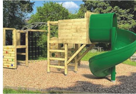
Junior multiplay Wonersh

Please contact the clerk@wonershparish.org if you wish to donate direct to the Parish Council.