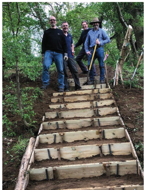
WEAG volunteers building steps on Public Right of Way

We hope this can all be completed by year end!